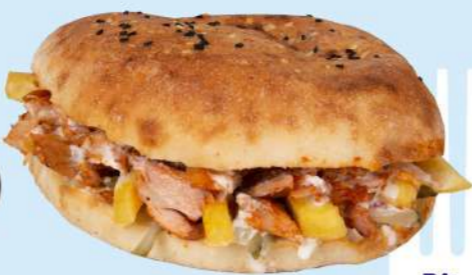
Lavash Roll 式薄包餅卷