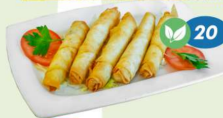
20 Sigara Boregi 土耳其式春卷 $70

Turkish Spring Rolls Deep fried pastry stuffed with cheese and parsley. 炸芫芝士春卷