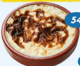
54 Sutlac 米飯布丁 $60 Traditional Turkish rice pudding 传统土耳其特式米飯布丁