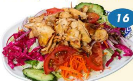
16 Salad with chicken doner $90

Salad topped with chicken doner 土耳其特式沙律配以轉燒雞肉