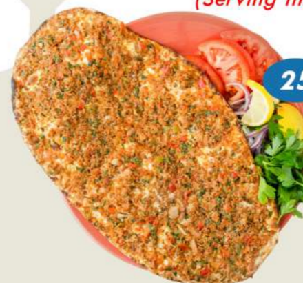
25 Lahmacun 啦馬村特式羊肉薄餅 $90

Thin and crispy grilled Anatolian style pizza, topped with a savory melange of ground lamb, tomato, and served with fresh salad 薄脆烤安娜托利亞式比薩, 配以香辣羊肉及蕃茄, 配新鮮沙律