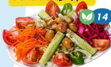
14 Green salad 田園沙律 $80

Romaine lettuce, onion and tomato salad with lemon vinaigrette 新鮮長葉生菜, 洋蔥, 蕃茄, 配以香醋檸檬