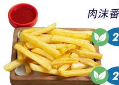
22 Potato Chips 炸薯條 $45