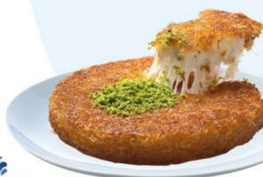
56 Kunefe 芝士甜餅 $70