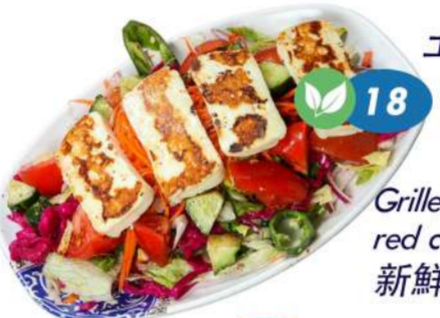
18 Grilled Halloumi Cheese Salad $120